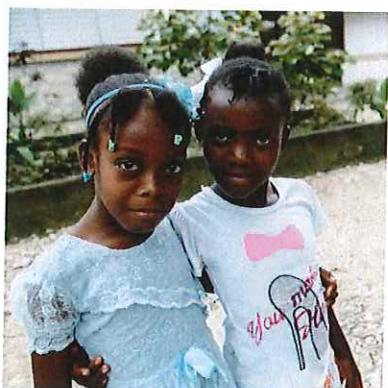
Children in Chauffard, Haiti

Say a prayer for all the people of Haiti as they mark the anniversary of the magnitude 7.0 Mw earthquake on January 12, 2010. The epicenter was close to Chauffard. Up to 300,000 people lost their lives in Haiti from that earthquake. Over the past 12 years, there have been hurricanes and another earthquake. There are now the challenges of the Covid-19 pandemic, political instability and shortages of fuel and food. The World Food Program says a record 4.7 million Haitians are facing acute hunger with 1.8 million at a critical level of malnutrition. Across the nation, schools have been closed for security reasons. According to the St. Kitts-Nevis Observer, "Gangs control major roads and draw income from customs, water and electricity distribution, and even bus services. . . The ongoing violence has forced the closure of hospitals and has been blamed in part for the re-emergence of cholera, as well as the fuel shortages."